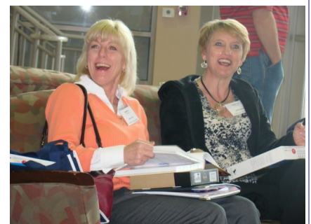
Conference participants seemed to enjoy themselves.