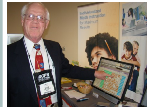
iLearn representative demonstrates the use of software.

Want to submit an article for the newsletter? E-mail all articles to stthomas@lawsonstate.edu