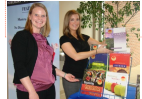
Hawke representatives showcase repertoire of resources.